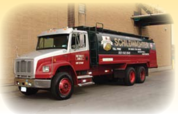
Schildwachter Oil: Fueling Relationships ...From ice cold to toasty warm thanks to superior customer service since 1904.